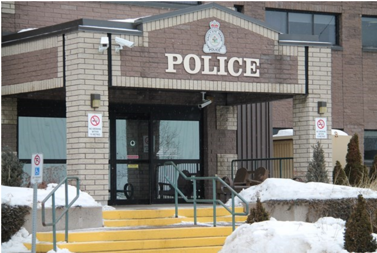
Existing Sault Ste. Marie Police Service building on Second Line.